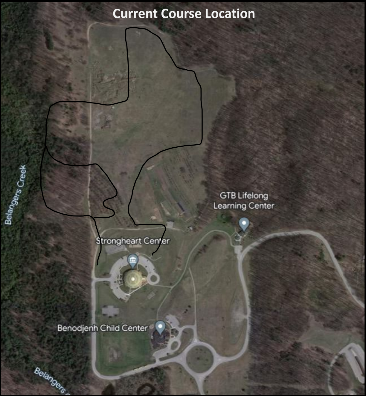
Current Course Location