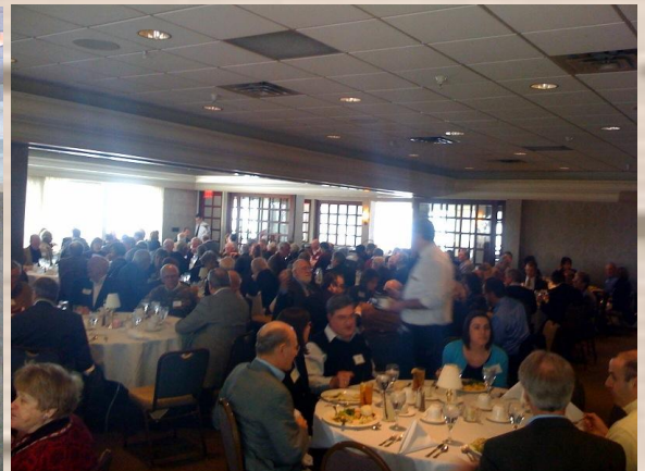
02.25.11 At the Traverse City Country Club on Friday, I had the honor of presenting to the Economic Club of Traverse City. I thoroughly enjoyed my time there and being able to present on behalf of GTB.