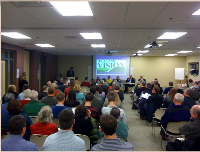
02.23.11 Wednesday night’s Grand Vision event, “Is The Bay Worth Half The Pay? A Panel & Discussion”, held at NMC’s Oleson Center focused on the importance on the natural resources to the future of our economy. I was asked to provide the Welcome to a great evening of sharing and dialogue.