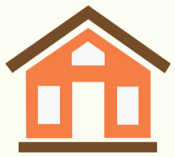
Houses with little to no AC