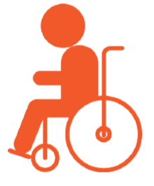
People with disabilities